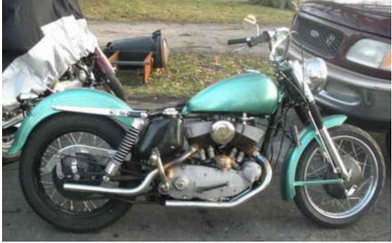
A great rare bike, rebuilt motor and tranny, it's 90 % restored.