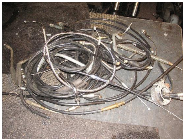
All these cables are going in the throttle tub.