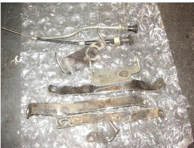
Three air filter support brackets and some choke cables and mounts.