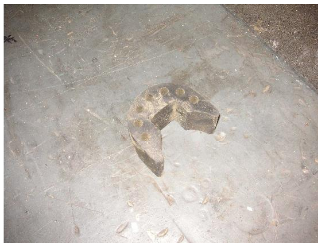
These is either for an FX gas tank or maybe it is for the XLCR tank I am going to mount on the 1980 show bike.