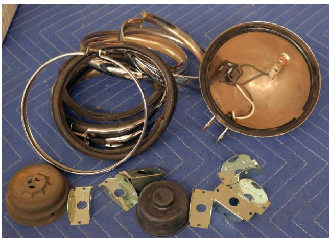
A bunch of headlamp rings, one bucket and the switch protectors.