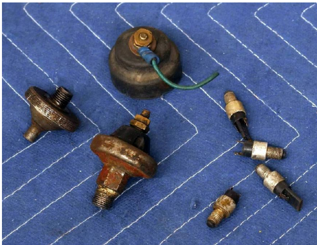
I tossed these oil pressure gauges in the oil bag tub, and brake switches in the brake tub.