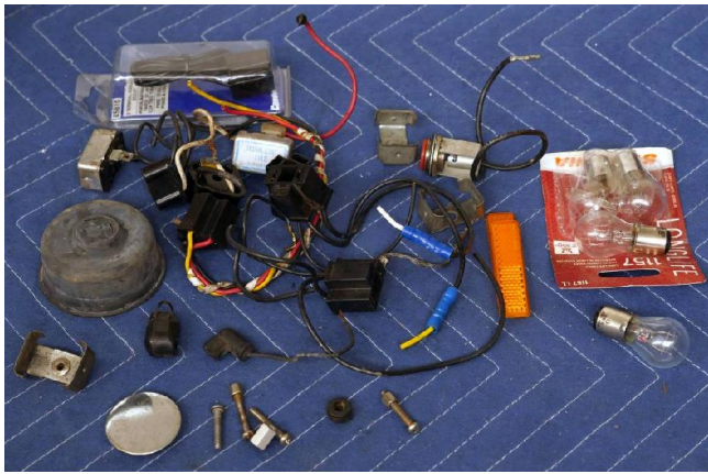
Here is all the little crap, now I have a picture so I know what is in the tub.