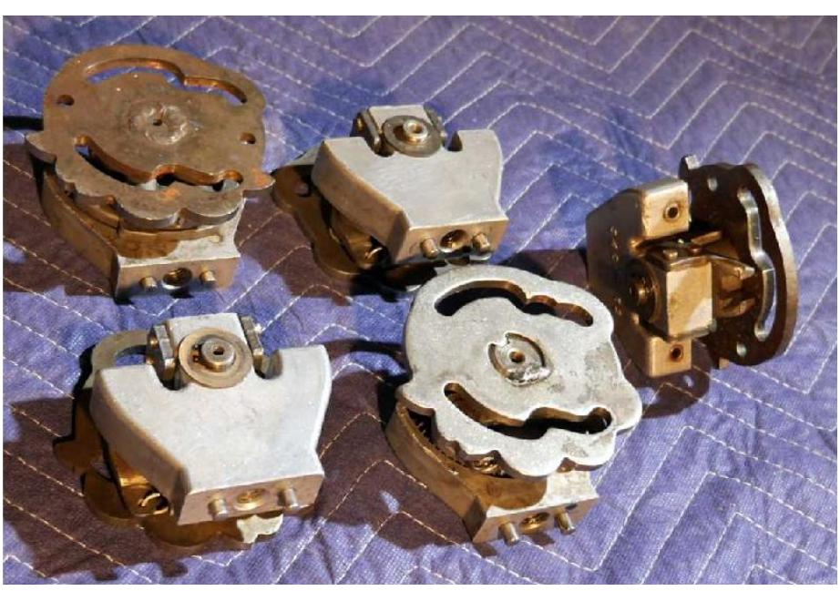
The Iron Sportster shifter comes as the 34009-52 assembly.

The Iron Sportster trap door assembly holds the mainshaft, countershaft, and shifter mechanism.