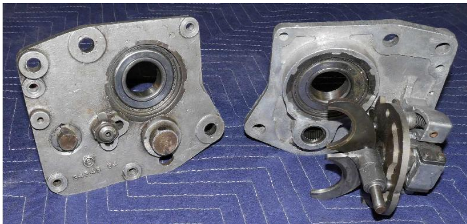
The Iron Sportster trap door assembly holds the mainshaft, countershaft, and shifter mechanism.

Two springs extend the plungers in the earlier carrier design. A single contraction spring pivots the hooks on the 1972 and later design.