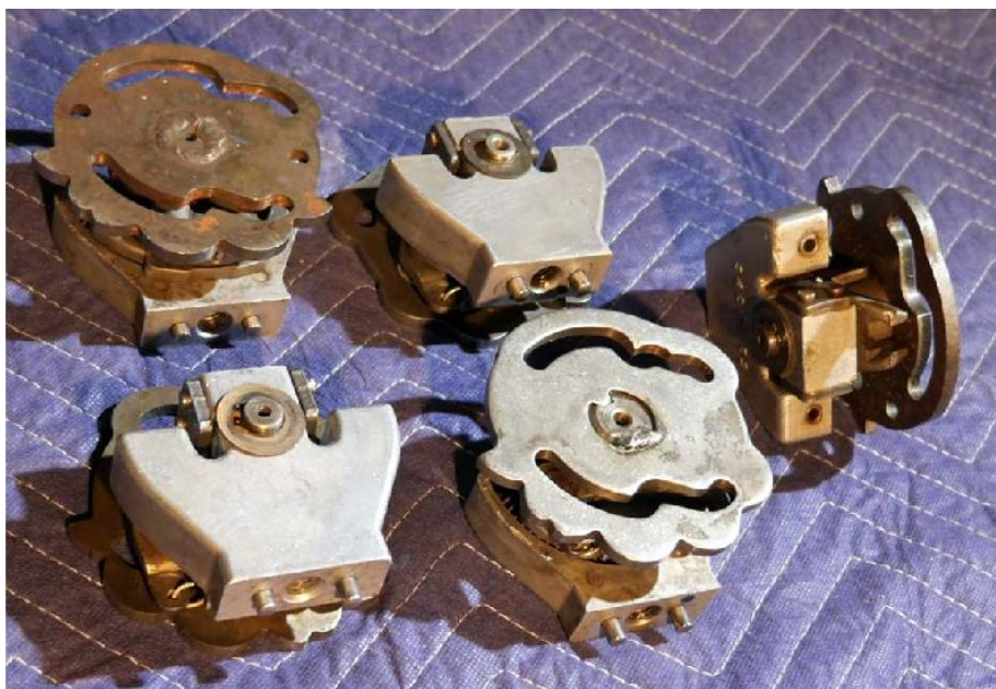
The Iron Sportster shifter comes as the 34009-52 assembly.