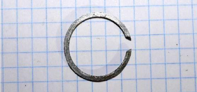
Sportster 35337-56 Mainshaft retainer ring

You should replace this every time you remove it from the mainshaft.