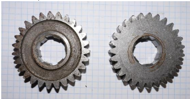
Sportster 35277-52A Mainshaft low gear, 1954-1984

The part changed to a 35277-52A in 1954, which should retrofit with this gear. Letter suffixes usually mean the part is very similar and will replace the part with no letter suffix.