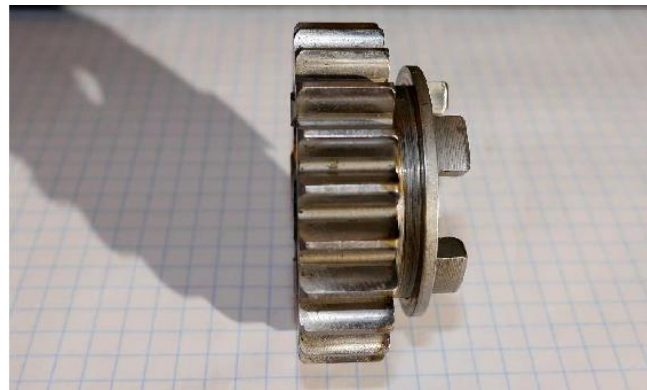
Sportster 35296-56 Mainshaft 2nd-gear, 1956-1978