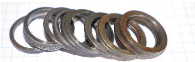
35836-55, 35838-55, 35839-55, 35840-52