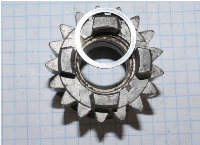
The washer goes in this pocket. You may need to stack two to get things to space out.