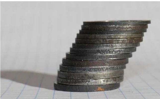
35836-55, 35838-55, 35839-55, 35840-52