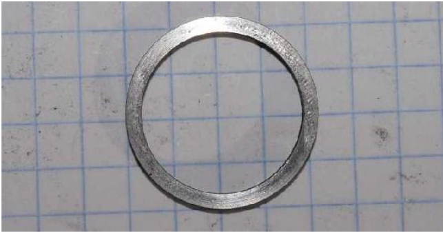
Countershaft thrust washer low gear left.